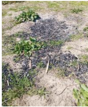
The state by which charcoal is thrown away