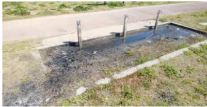
The state by which charcoal is thrown away in a water place