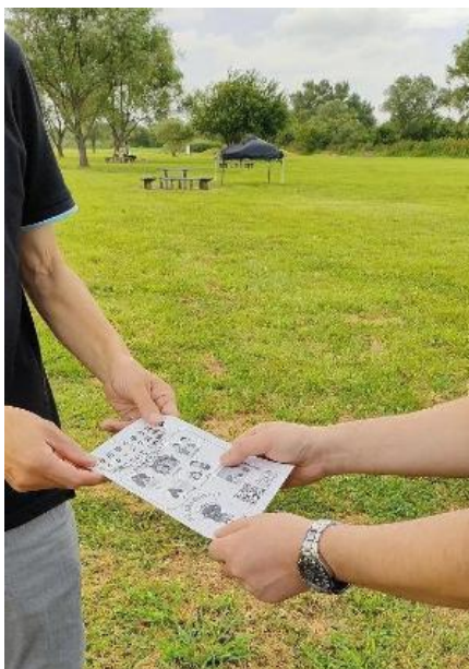
The state of the enlightenment handbill distribution